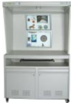
The EVS-3552/SP can accommodate up to two 30" LCD monitors.

The single or dual LCD's (not included) can easily be positioned for optimal viewing since each mounting arm allows full swivel, tilt, or pull-out (for calibration) adjustability of the LCD. Also included is the GTI LiteGuard II viewing system monitor (indicates when unit is warming up and when unit needs to be relamped).