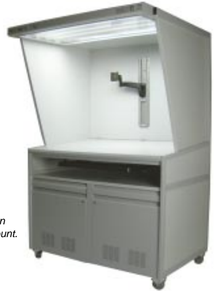
EVS-3552/SP shown with single LCD mount.